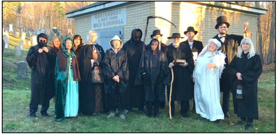
Last year's spirited cast invites you back to the Center Cemetery for more!

Sponsored by Lamb, Petersen & Mann Advisory Group.