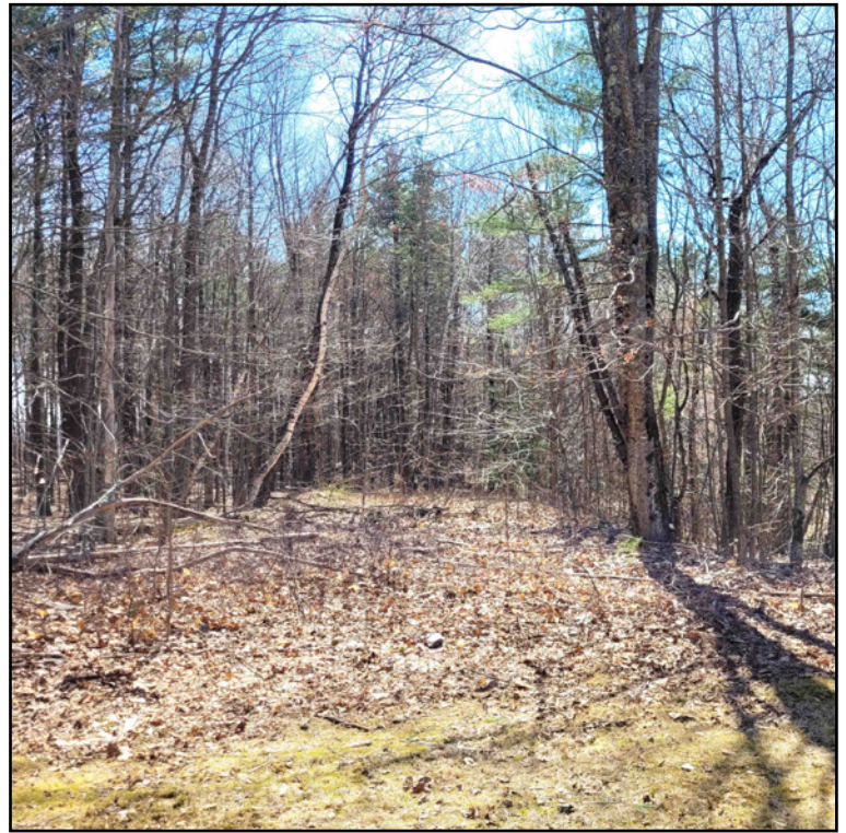
The Outdoor Classroom before (above) and after (below)!