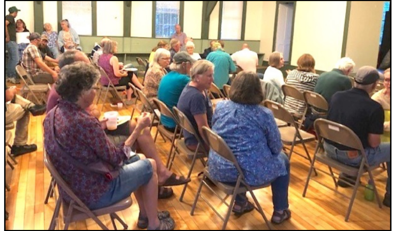
September's meeting drew more than 40 residents!

It is hoped that the draft of the updated Master Plan, or Plan for Tomorrow, will be available to residents to read by Nov. 1. It will be in digital form on the town website, and hard copies will also be in the town office, library and country store.