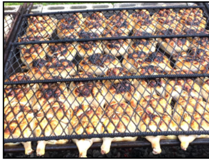
Can't you just smell the chicken?

Food Tent: Chris Cornog needs about a dozen or so volunteers for shifts. You can reach Chris at 603-496-8733 or chris@paxtoncommunications.net .