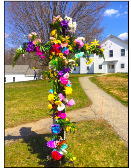
This Easter, as in years past, we will adorn the cross with flowers. Please join us for this special service! Details on Page 3.