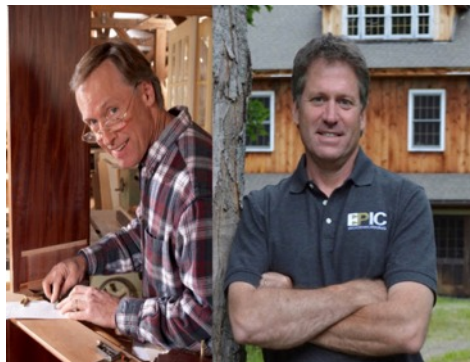
Sneak peak - See back page for details